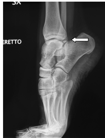
Figure 2: Note the posterior impingement of os trigonum during releve.