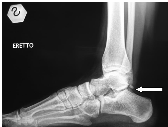
Figure 1: Note the presence of os trigonum.